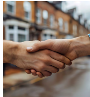
Pledge Form 21