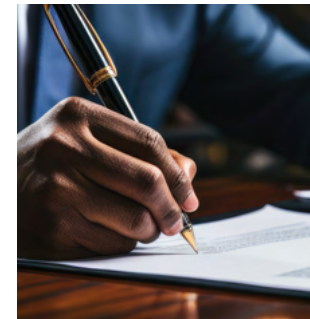
Terms and Conditions 20