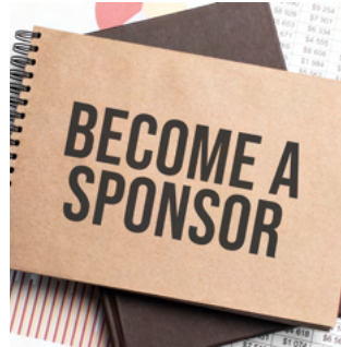
Sponsorship Opportunities 8