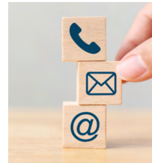
Contact Us 20