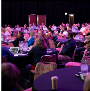
The Event 4