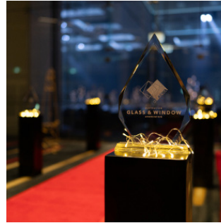
Benefits of Participation 6